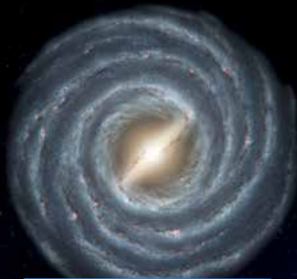
MILKY WAY GALAXY