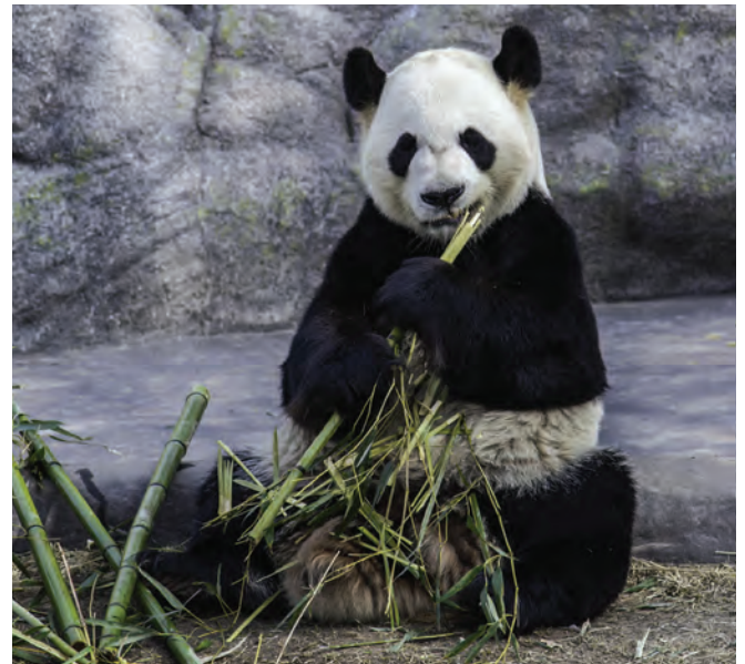
Panda at a zoo in Canada

Australia Canada Finland Germany Japan Mexico United States Scotland Spain