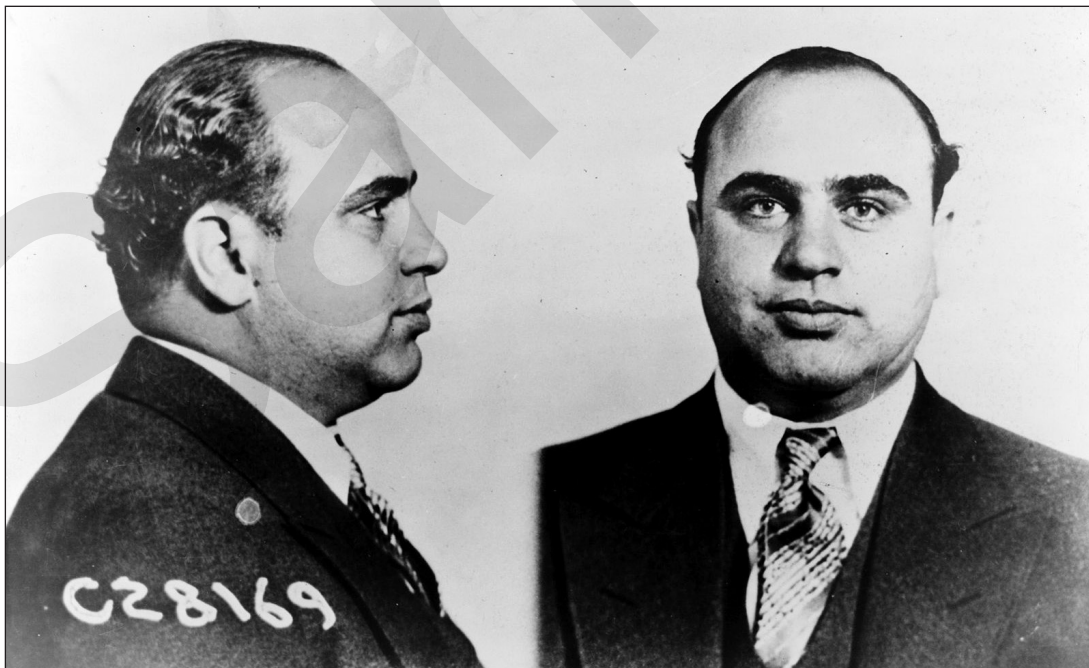
Al Capone's mugshot when he was sent to prison.

Tours of Alcatraz started in 1973, 10.5 years after the prison closed. During those ten years, the question of what to do with the island was debated. Should it become a location for a West Coast statue like Lady Liberty? Should it be allowed to be claimed by Native Americans? A nineteen-month Native American occupancy that occurred from November 1969 to June 1971 seemed to indicate that this idea was plausible. Eventually, the island became part of the Golden Gate Recreational Area, and over a million tourists ferry over each year to one of San Francisco's most popular attractions. Visitors can see the seabirds nesting, enjoy the sights of the Bay, and step inside the prison walls to be guided on an audio tour of the cell block and prison cells where some of the nation's most dangerous criminals were kept.