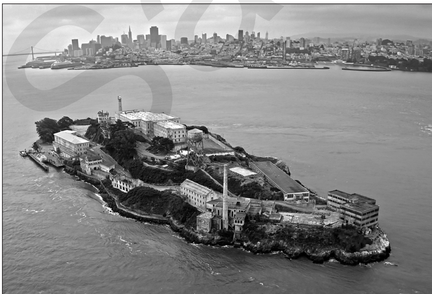
Alcatraz from the air.