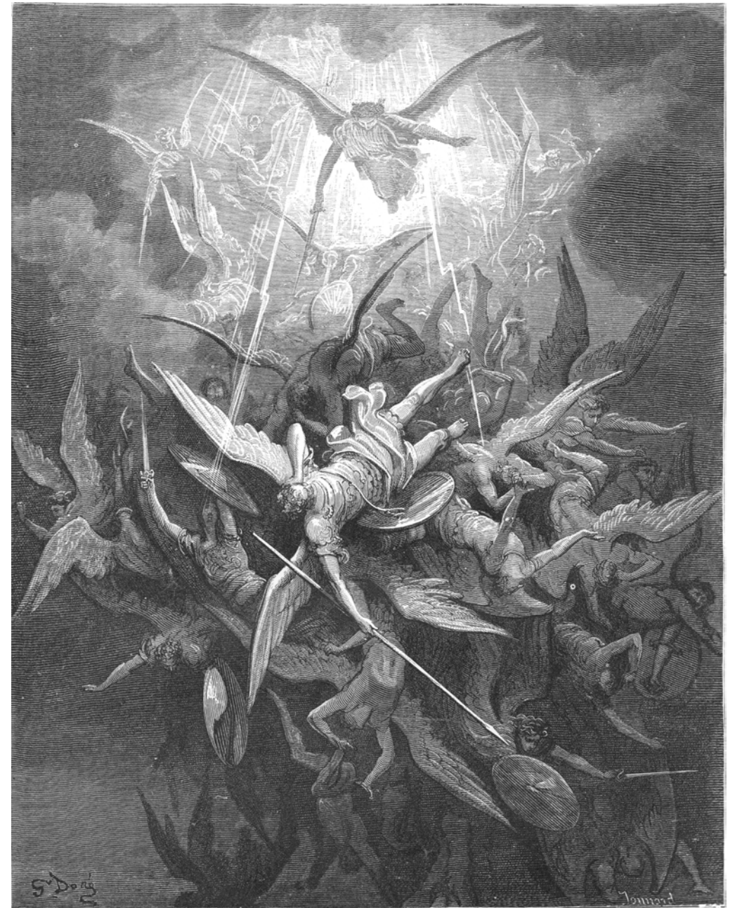
Book I, Lines 44-45

A dungeon horrible, on all sides round, As one great furnace flamed; yet from those flames No light; but rather darkness visible Served only to discover sights of woe, Regions of sorrow, doleful shades, where peace And rest can never dwell, hope never comes That comes to all, but torture without end