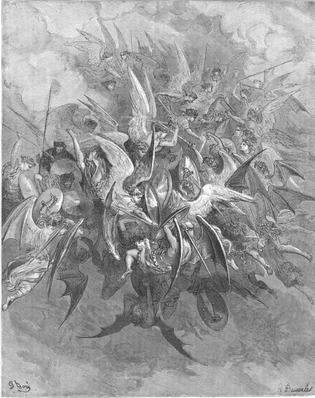
Book VI, Lines 207-209