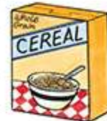
Let's taste the grain cereal.