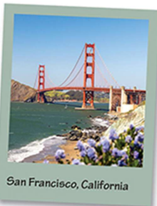
San Francisco, California

When Spain began its conquest of the Americas at the end of the fifteenth century, one of the first activities of the exploradores and conquistadores was to rename the places they encountered and conquered with Spanish names . Since the Spanish rulers of the time were devout Catholics, many of the names chosen honored saints and beliefs of the Catholic Church or referred to familiar places in Spain. In the United States, particularly in Florida and in the southwestern and western parts of the country, this tendency is reflected in names such as Cape Canaveral, San Francisco, Santa Fe, or Alameda County.